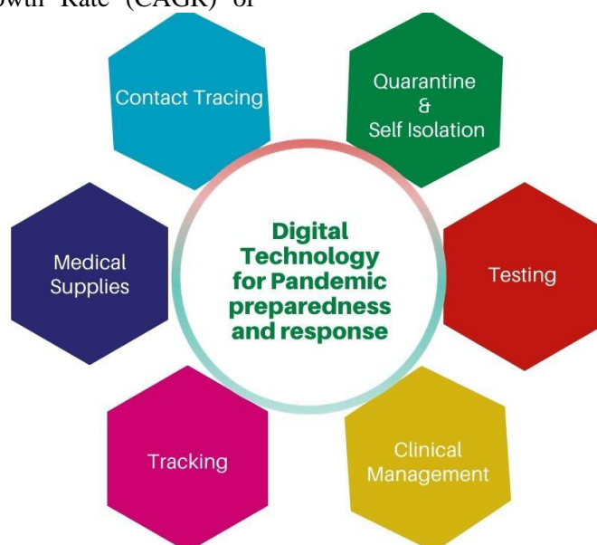
Fig. 2 : Digital Technology for Pandemic preparedness and response

Figure-2 shows the use of technologies in various phases of the disease. Technological advancements are utilized for testing the suspected individuals, tracing the contacts of COVID-19 infected and suspected ones. People with fewer risks are asked to stay home quarantined. Patients with comorbidities are institutional quarantined. They can be monitored using remote patient monitoring, virtual consultation, etc.