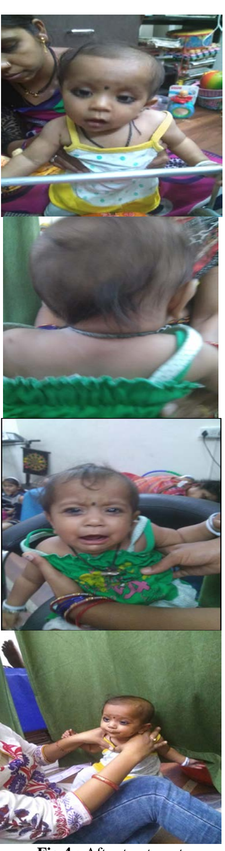
Fig.4: After treatment