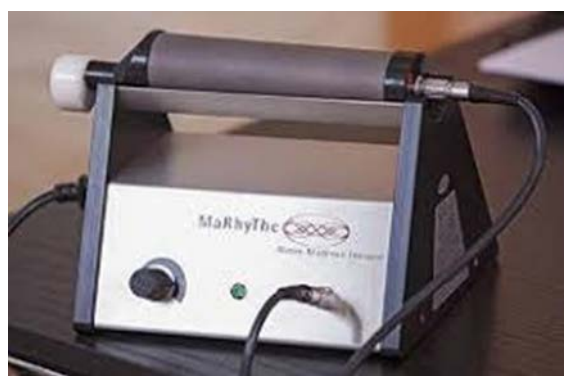
Fig. 2:Instrument :Matrixmobil