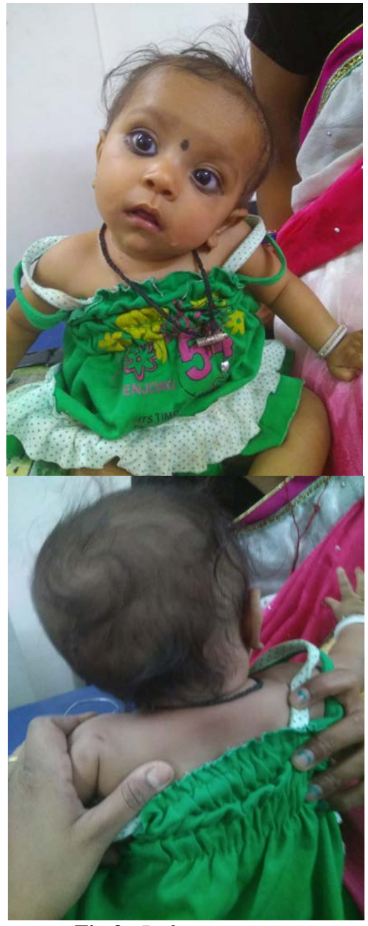
Fig.3: Before treatment