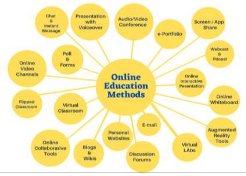
Fig. 1: Available online education methods.

Online education is realized by using a range of synchronous and asynchronous ICCT tools. Some tools such as wiki, blogs, email, chats, etc. are web tools, also called 'social media. Some others such as Google Meet, Zoom, Microsoft Team, Cisco WebEx, Zoom, etc. support face-to-face interactions between the teacher and the students. And a few tools such as Google Classroom, Moodle, etc. create Virtual classrooms mimicking the real classroom. Asynchronous tools are tailor-made for tasks that expect manifestation and more time to fulfill. They are especially used when learners hesitate to collaborate effectively in real-time interactions due to shy nature, lack of language fluency, or socioreligious factors. However, synchronous tools provide an interactive platform for a higher degree of social presence. Here instructors and participants speak, chat, and discuss the subject matter freely without any hesitation in real-time scenarios. Figure-1 given below provides a glimpse of different options available for online education [27].