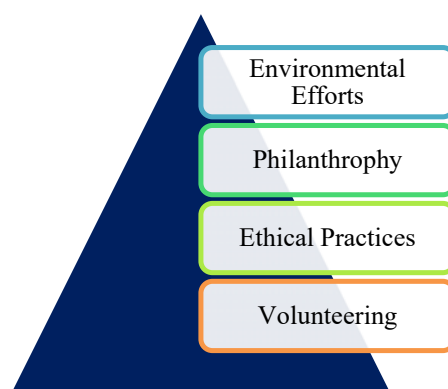
Fig. 1 : Classification of CSR