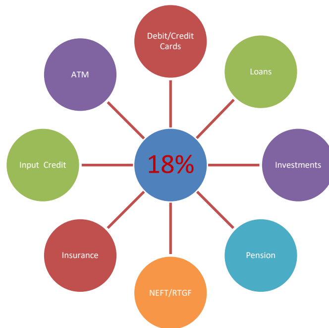
Fig. 2: The figure represents various products and services provided by banks which charge 18% GST replacing the 15% tax.

Investments like mutual funds are affected negatively due to the introduction of GST. GST bang on the income of mutual funds will certainly have an effect on the consumers. For an investment company, an expense ratio is a cost incurred by them to operate their mutual funds. The Goods and Service tax will be on the Total Expense Ratio of the mutual funds and has been increased by 3%. In case of the policyholders, they have to pay high premiums amount on their insurance assuming, a family spend a sum of Rs 50,000 per annum on insurance exclusive of service tax, their expenses will be increased by 3%, i.e., Rs 1500. Earning up to Rs 20 lakh will stay exempted from GST for mutual fund distributors [18], [19].