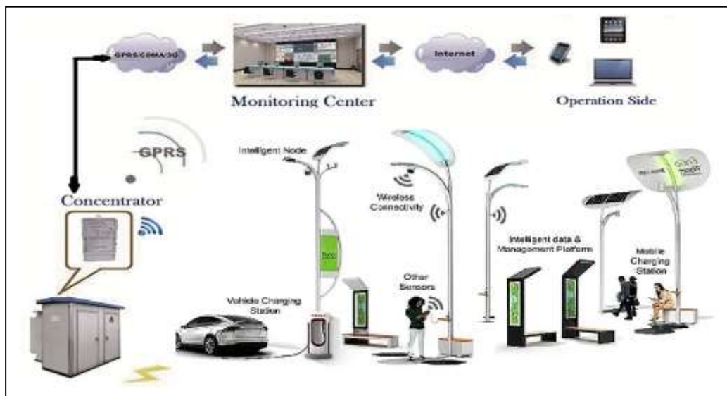
Fig. 2: Typical Smart Street Lighting for Smart City

Refer figure 2, which is showing a typical Smart Street Lighting System for Smart Cities. As shown in the figure, the smart street lighting system contains communication modules, lighting poles, light sensors, network modules, monitoring center, user interface apps etc. The conventional street lighting system keeps its operation limited to manually turn on and off lights. But the Smart Street Lighting System can do much more, for example dynamic turn on and turn off streetlights based on predefined conditions and or schedule, automatic light intensity controls, dimming of lights from remote, data analysis of power consumption, energy saved, operating cost etc. Smart Street Lighting System is part of Smart Lighting System and contains similar components and features which can be applicable for a Smart Lighting System.