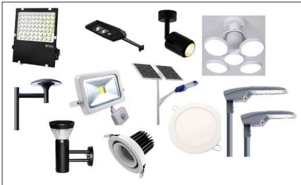
Fig. 1: Different LED Light Products used across Smart City

Using LED lights in place of conventional lights can reduce the power consumption, however if LED lights can be turn on and off in a controlled manner then it can further optimize the power usage. There are three different types of controlling LED Lights, each can offer significant advantage and benefits and have certain limitations as well. Refer table 2, which has stated comparison among three types of LED Lights controls with respected to its operating features, benefits, and limitations of each lighting control scheme. As clear from Table 2, LED Lights can reduce power consumption but just using LED Lights is not a smart and or intelligent solution, it cannot provide any other useful information such as power consumption statistics. To get the best out of LED Lights it is also necessary to have the functionalities like intelligently on/off control, brightness control, etc.