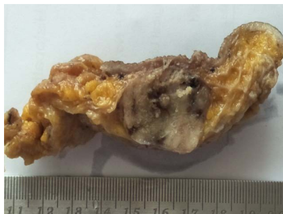
Fig. 1: Cut section showed a well circumscribed mass having grey white and mucoid areas with areas of haemorrhage.